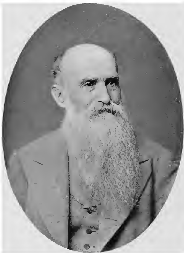
GENERAL JUBAL ANDERSON EARLY